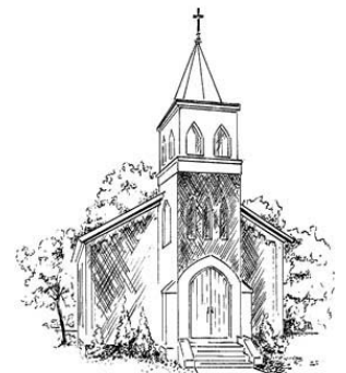
St. Stanislaus, Chatsworth Sunday 9:00 am